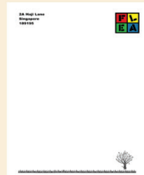
Invitation, stickers, shopping bag & stationery

Figure 3 shows the creative solutions for a design problem to promote an eco-friendly 'Flea Market'. The problem was selected by a group of students themselves. They designed the creative strategy, creative approach and the message for their target audience. They also designed the visual applications like the posters, stationery etc to create a visual brand identity for this event. The outcome is a very attention grabbing brand identity with designs that are creative and original, and professionally executed.