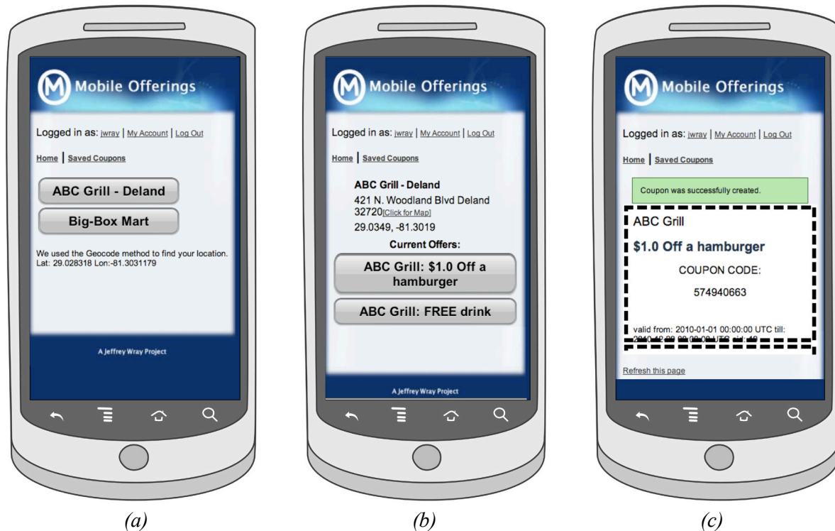
An example of a mobile user searching for and activating a coupon to be redeemed at a POS: (a) user is provided with all merchants in area; (b) all coupons for a merchant are displayed; (c) a coupon detail view of a particular coupon with activation code is presented to the user.

Step 5 illustrates the communication between the POS and the MAE system. Complications due to hardware and infrastructure compatibility at the point of redemption presently make this a difficult problem to solve. While countries like Japan and Korea have more readily installed specialized mobile device readers at the POS, the U.S. and European countries have been much slower in doing so (Holmen, 2009). While image scanners that work at the pixel level are capable of scanning 1-D and 2-D bar codes off of phone screens, infrared scanners do not because the screens absorb too much light to effectively allow the black-white contrast to be picked up (Reedy, 2009). Also, even if image scanners exist at the POS, many POS systems, especially for larger brands, have software that is custom written. Therefore, integration with the particular software installed on the POS system must presently be done on a case-by-case basis.